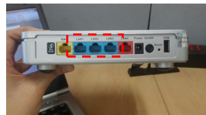
Wireless Router LAN ports

36 Why didn't I get the speed as advertised?